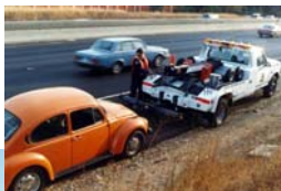
FSP trucks are white and display the FSP logo

In addition to reducing congestion, the Freeway Service Patrol program helps make our freeways safer by providing valuable motorist assistance. Another benefit is improved air quality.